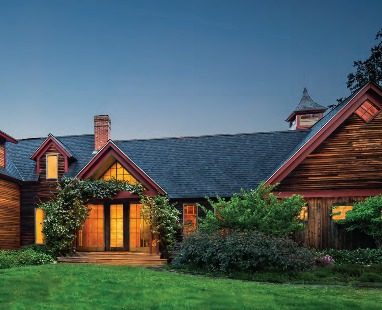
Clockwise: The exterior of the award-winning remodeled home in Fayston features resilient and beautiful Western red cedar clapboard and shiplap siding. A classic, functional style for any kitchen, a deep farmhouse-style sink was a must-have for the clients. Custom-milled heart pine flooring was installed throughout the newly remodeled open floor plan for the first floor.