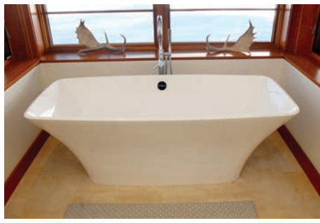
Like the rest of the house the master bedroom (left) features a neutral color palette with accents of wood, and the master bathroom features a travertine tiled floor, a contemporary standing tub, as well as his and her separate, flanking vanities, designed by Cushman Design Group and made from Douglas fir and topped with Caesarstone in Lagos blue.