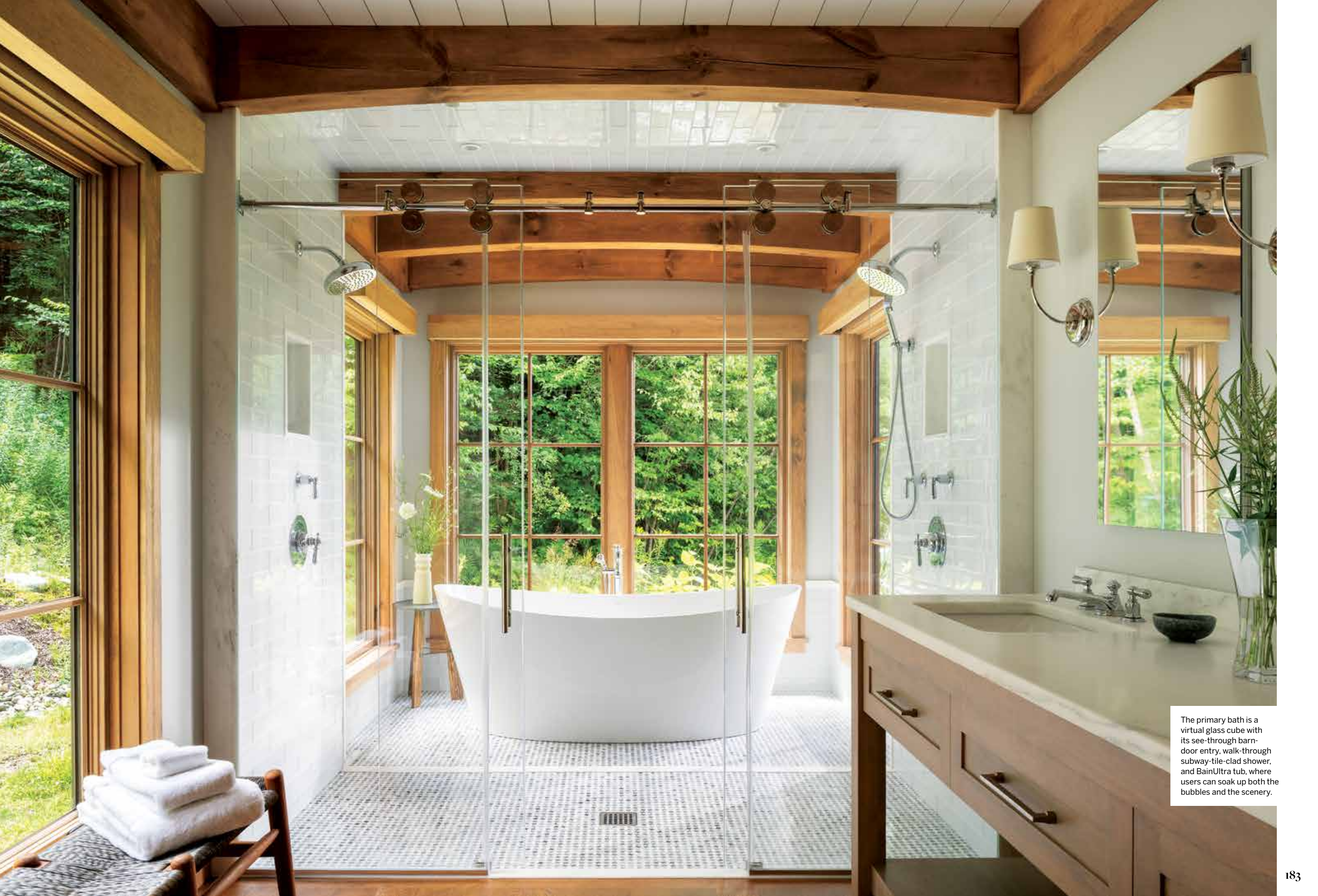
The primary bath is a virtual glass cube with its see-through barn-door entry, walk-through subway-tile-clad shower, and BainUltra tub, where users can soak up both the bubbles and the scenery.