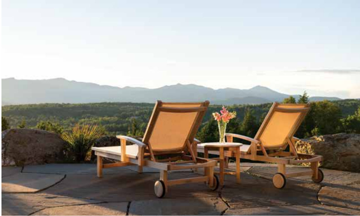
ABOVE: The west-facing patio means unobstructed sunsets from a private perch that's only 400 feet away from the main residence via a stone-paved bridal walk, originally created by Cushman Design Group for a family wedding. RIGHT: The sunken firepit is a family gathering place even when Peak Sanctuary isn't in use. FACING PAGE: A wrought-iron bed frame by Made Goods helps keep the second-floor guest room feeling light and airy like the rest of the retreat.

A sturdy portico of Douglas fir helps break up the boxy outline of the two-story home, and a variety of durable native woods stand up to harsh Green Mountain winters. "It's a serene and natural space but also luxurious in its lighting and amenities," notes Flanagan.