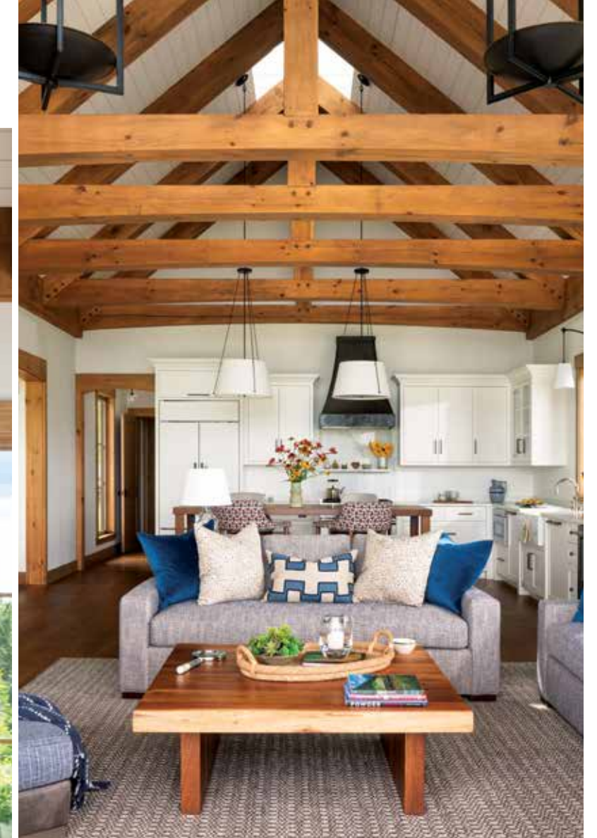
CLOCKWISE FROM LEFT: The open kitchen, contiguous with the great room, reflects the home's role as a hub for entertaining: the elevated table blends formality and comfort while also allowing diners to peer over the great room furniture and drink in the mountain views. A live-edge coffee table harmonizes with the overhead cross beams and the rough-hewn granite mantel on the nearby fireplace. A small under-stair space was carved out for a powder room, with Wayne Pate + Studio Four NYC wallpaper adding a cheerful pop of color.