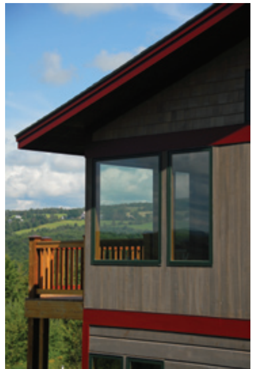
Top photo: Looking back at the kitchen from the dining area, with a screened porch and deck to the right. Above: The home sits atop a steep hillside on six acres in the town of Calais; it is used as a vacation and writing retreat.