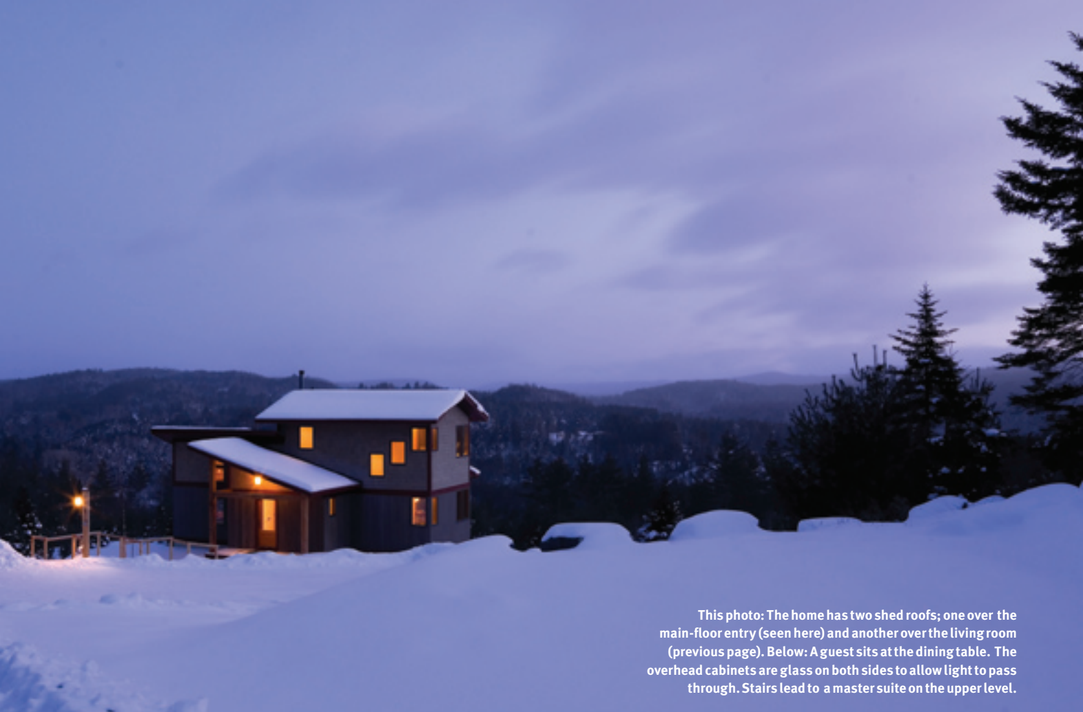
This photo: The home has two shed roofs; one over the main-floor entry (seen here) and another over the living room (previous page). Below: A guest sits at the dining table. The overhead cabinets are glass on both sides to allow light to pass through. Stairs lead to a master suite on the upper level.

rooms, a small office nook for David, a full bath and the utility room. The top floor contains the master suite.