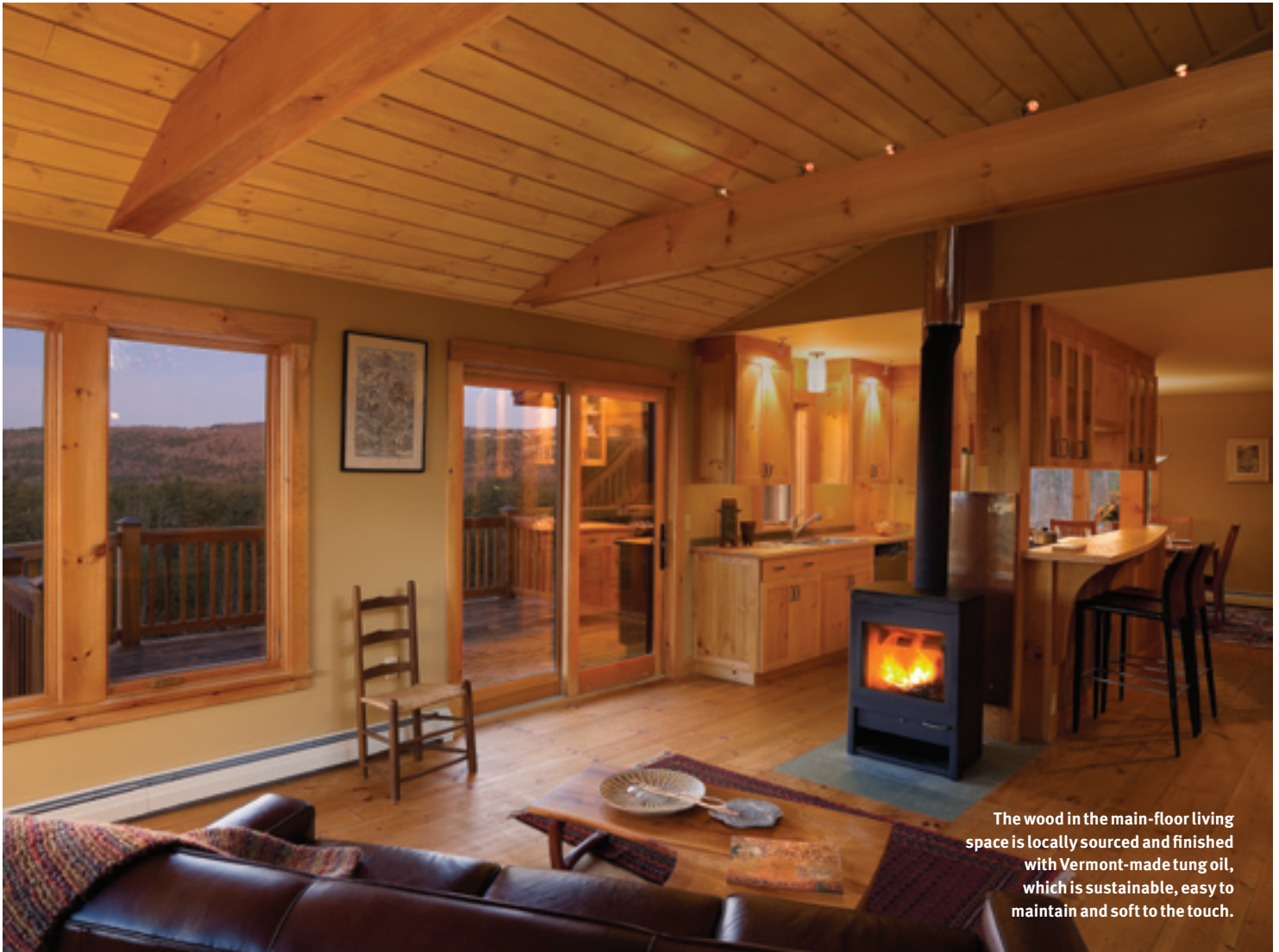
The wood in the main-floor living space is locally sourced and finished with Vermont-made tung oil, which is sustainable, easy to maintain and soft to the touch.