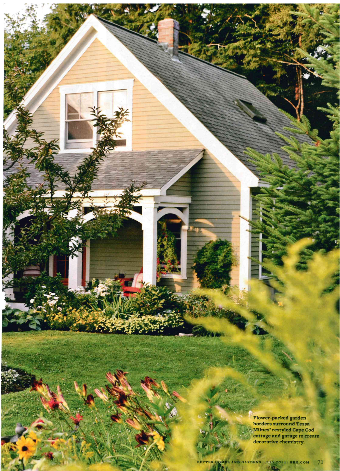
Flower-packed garden borders surround Tessa Milnes' restyled Cape Cod cottage and garage to create decorative chemistry.