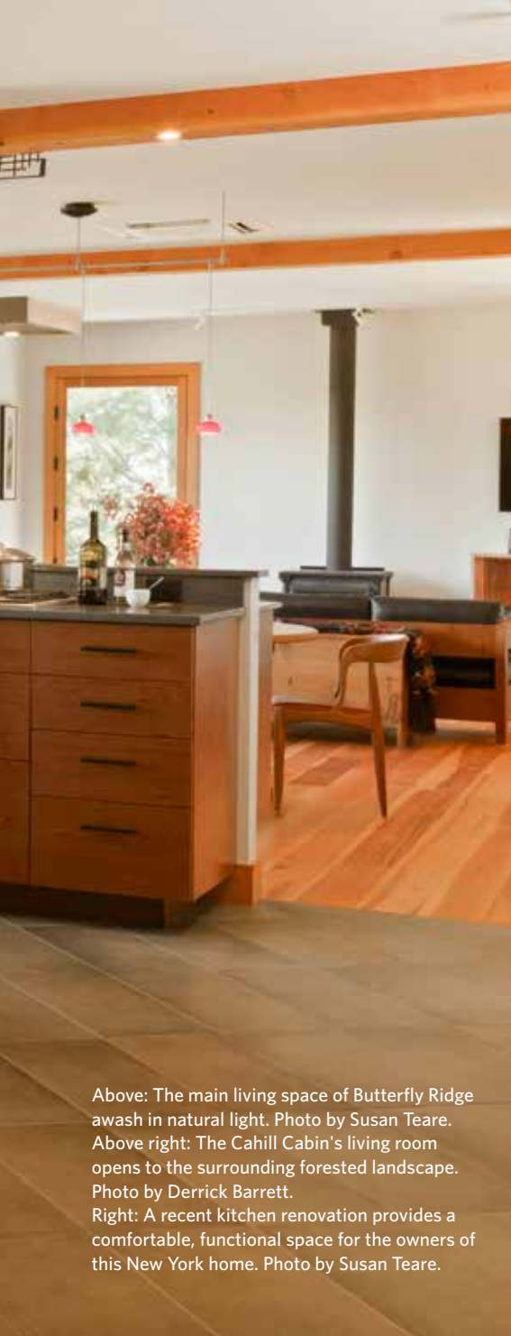
Above: The main living space of Butterfly Ridge awash in natural light. Photo by Susan Tearé. Above right: The Cahill Cabin's living room opens to the surrounding forested landscape. Photo by Derrick Barrett. Right: A recent kitchen renovation provides a comfortable, functional space for the owners of this New York home. Photo by Susan Tearé.