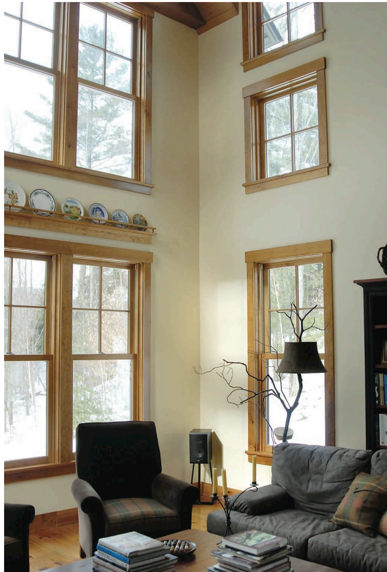
◀ Living room ▼

The site they found, Chuck says with relish, "has privacy within a small community of homes, wonderful views, and an incredibly good location" near the Mountain Road. (Full disclosure: I was their real estate broker during this long process and have thoroughly enjoyed watching their steps to success.) ▶