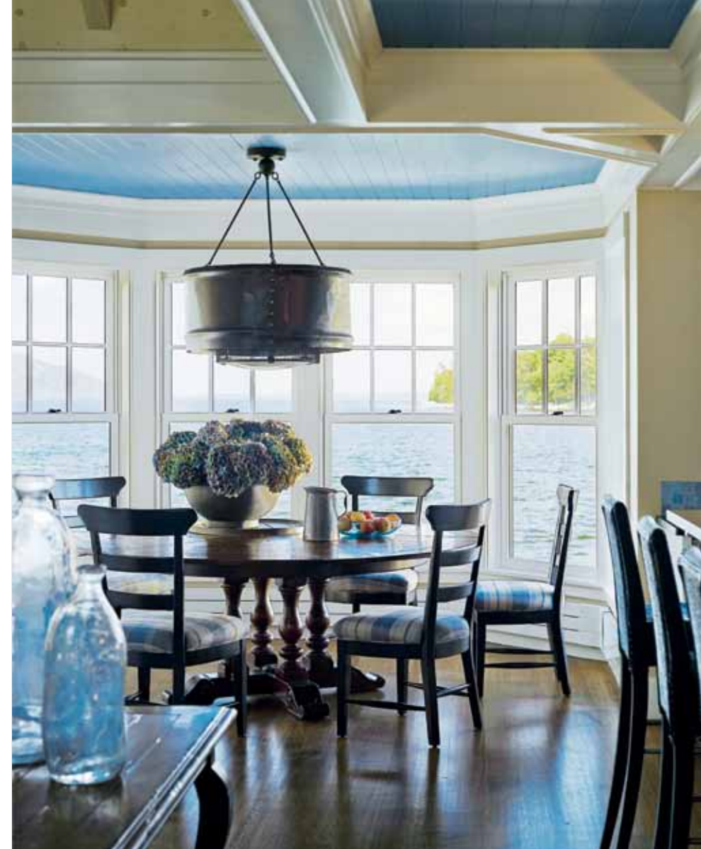
ABOVE: A sky-blue ceiling reinforces the dining area's connection to the outdoors. RIGHT: The summery blue of the Moroccan tile backsplash was the starting point for the kitchen's design. The coffered ceiling is an illustration of the home's high-quality craftsmanship. FACING PAGE: Milford Cushman designed the two-tiered chandelier made of antique mason jars that hangs from the living room's soaring ceiling.

Keep in mind, all this had to be accomplished on a tight, sensitive